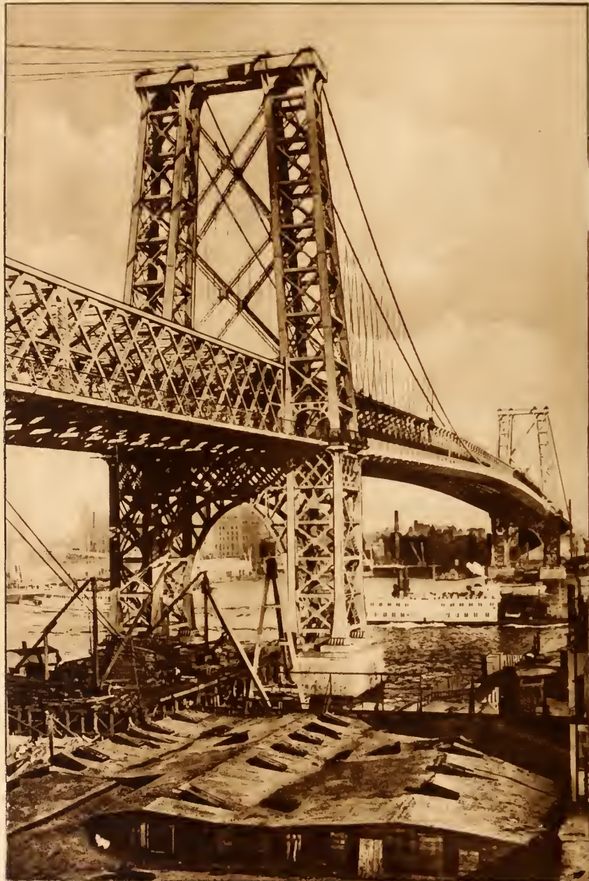
WILLIAMSBURG BRIDGE, from Broadway, Brooklyn, to Delancy Street, Manhattan. 7,200 feet long, 118 feet wide, towers 335 feet above water. Cost $23,000,000.